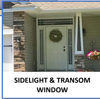
SIDELIGHT & TRANSOM WINDOW