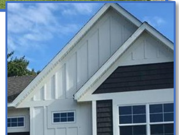
BOARD & BATTEN