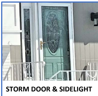
STORM DOOR & SIDELIGHT